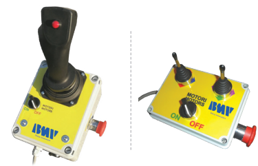
JOYSTICK AND CONTROL BOX