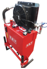
40 LT. MOBILE TANK