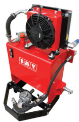
40 LT. FIXED TANK