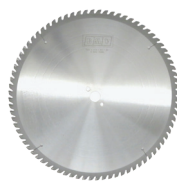
SAW DISC FOR DRY CUTTING