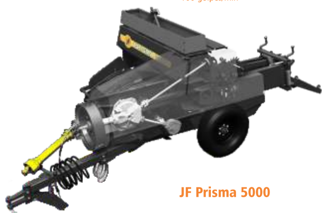
JF Prisma 5000