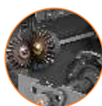
Transmissão por engrenagens e eixo