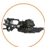
Nosador alemão Rasspe