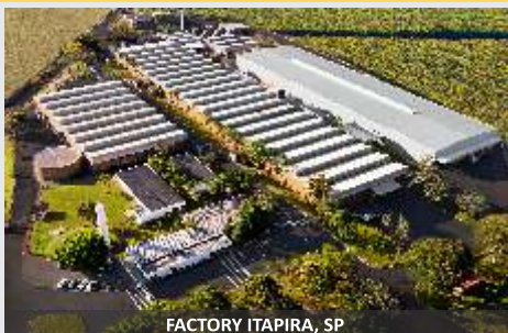
FACTORY ITAPIRA, SP