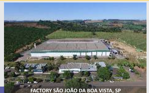
FACTORY SÃO JOÃO DA BOA VISTA, SP

Hay Equipment line JF, the solution for the farmer!