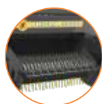
Pick-Up de 1,73m (Prisma 5000)

Note: Please contact your dealer in order to know which itens are standard and optional.