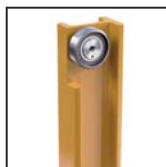
Straight roller radial bearings