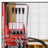
Distributor with 4 levers