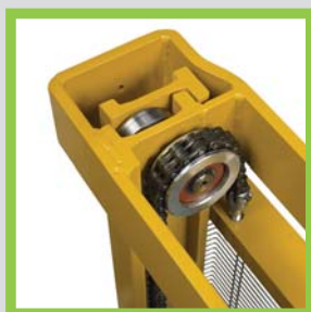
Hot-rolled steel profiles