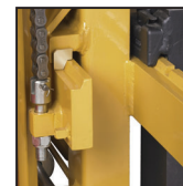
FEM side shift pads