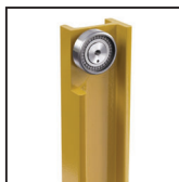
Straight roller radial bearings