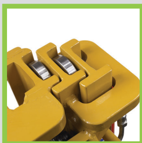
Hot-rolled steel profiles