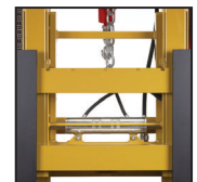
FEM side shift