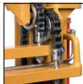
"Fleyer" type lifting chains