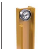
Straight roller radial bearings