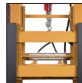
FEM side shift