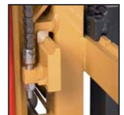
FEM side shift pads