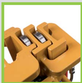
Hot-rolled steel profiles